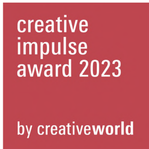
The new logo for the Creative Impulse Award.